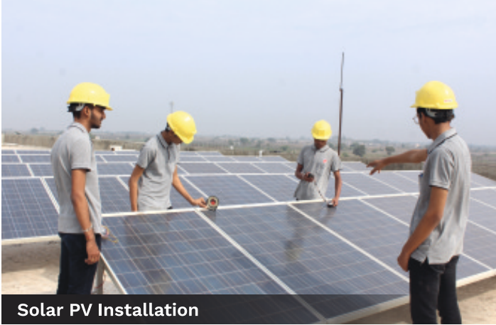
Solar PV Installation