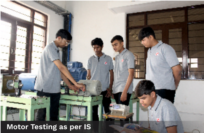
Motor Testing as per IS