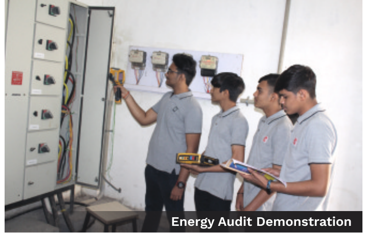
Energy Audit Demonstration