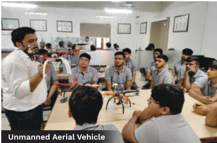
Unmanned Aerial Vehicle