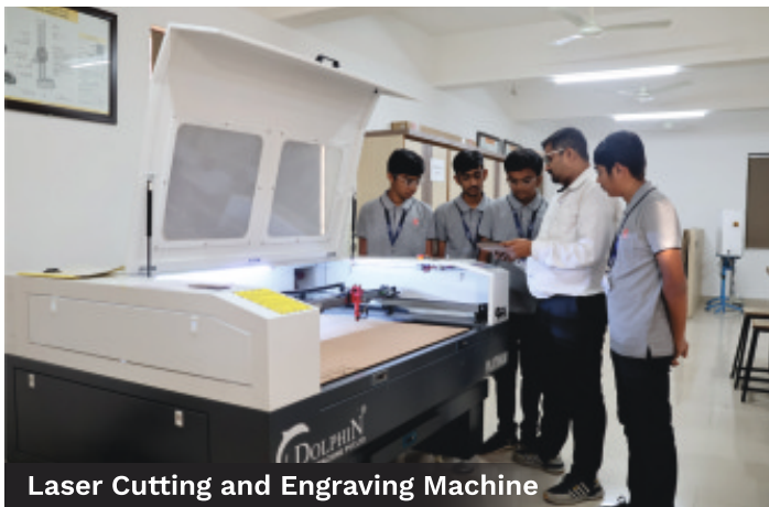
Laser Cutting and Engraving Machine